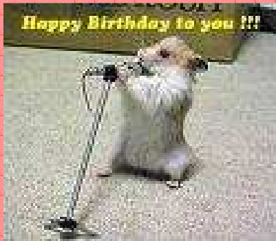
Happy Birthday January